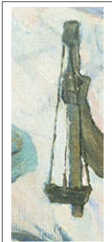
The Apocalyptic Steelyard

‘And I heard a voice in the midst of the four beasts say, A measure of wheat for a penny, and three measures of barley for a penny and see thou hurt not the oil and the wine’