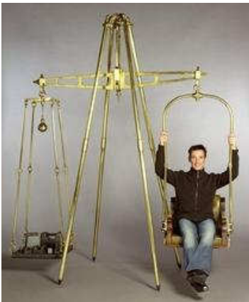
A real Jockey Scale (complete with famous jockey who appears to weigh 11st 3lb)

The Jockey Scale was to be found on many British seaside promenades and