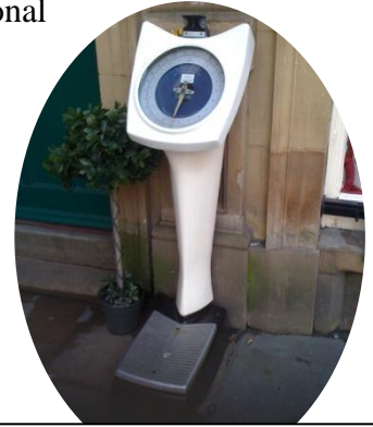
An Avery Person weigher, still in use on the streets of York. The white version was made for the Boot's company

When I was a young trainee Inspector of Weights and Measures, lots of my time was spent acting as an assistant to one of a number of grizzled old misanthropes. Collectively, they taught me a lot – the job was more about dealing with people than I was led to believe at interview. And one point that sticks with me even today is 'always look for the stamp!' I speak of course about the Government Stamp, the majestic Crown with a number below it, which could mean all the difference between a trader being judged fair and above board, or underhand and positively criminal. In those days the stamp on a scale or weight was usually impressed on a lead plug. While the Inspector graciously